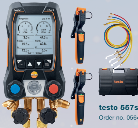
testo 557s Order no. 0564 5572