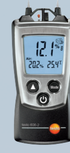
testo 606-2 humidity measuring instrument For recording wood and material moisture as well as air temperature and air humidity. Order no. 0560 6062

With laser measurement spot marker for non-contact surface temperature measurement. Order no. 0560 8312