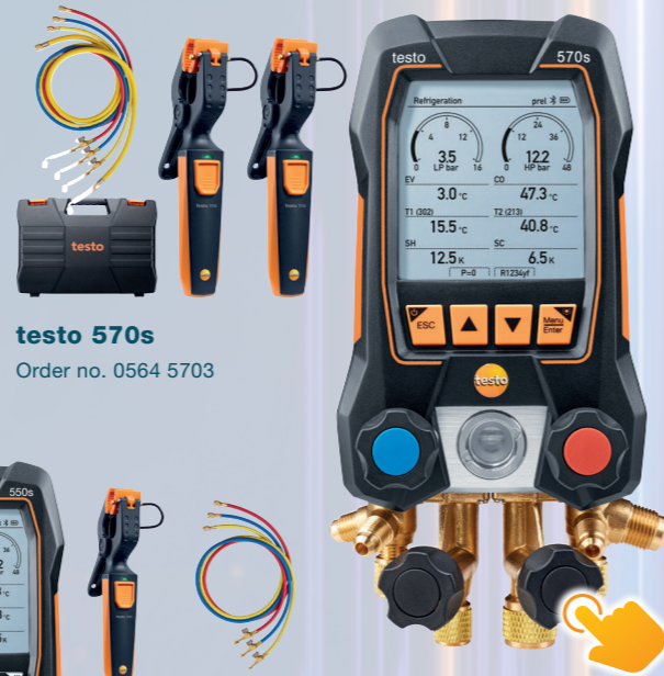
testo 570s Order no. 0564 5703

Smart digital manifolds with wireless clamp temperature probes and charging hose set in a practical case.