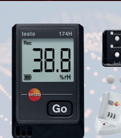
testo 174 H kit Mini data logger

For continuous temperature measurements, measurement data memory for 16,000 values, incl. mini data logger USB interface for programming and readout, and wall bracket. Order no. 0572 0561