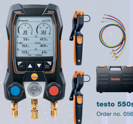
testo 550s Order no. 0564 5503