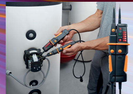
testo 750-2 voltage tester

For measuring current, voltage and resistance. • Automatic measurement parameter recognition • Current measurement in the µA range • True root mean square measurement TRMS Order no. 0590 7602