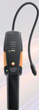
testo 316-3 Leak detector for refrigerants • High sensitivity (< 4 g/a) • Easiest operation with a single button Order no. 0563 3163

Should not be missing in any refrigeration equipment: Testo leak detectors reliably locate all common refrigerants and, thanks to their high sensitivity, find even the smallest leaks quickly and reliably.