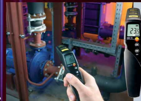
testo 830-T2 infrared thermometer

With laser measurement spot marker for non-contact surface temperature measurement. Order no. 0560 8312