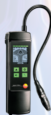
testo 316-4 Leak detector for refrigerants • Very high sensitivity (< 3 g/a) • Visual and acoustic alarm for optimum leakage detection Order no. 0563 3164