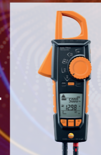
testo 770-3 clamp meter with Bluetooth®

For continuous temperature and air humidity measurements, measurement data memory for 16,000 values, incl. mini data logger USB interface for programming and readout, and wall bracket. Order no. 0572 0566