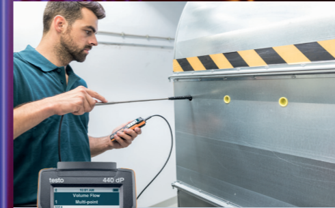
testo 440 dP IAQ measuring instrument

For the adjustment of air conditioning and ventilation systems, the monitoring of air quality or comfort measurements. Order no. 0560 4402