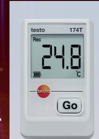
testo 174 T kit Mini temperature data logger

For continuous temperature measurements, measurement data memory for 16,000 values, incl. mini data logger USB interface for programming and readout, and wall bracket. Order no. 0572 0561