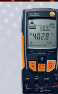
testo 760-2 digital multimeter

For measuring current, voltage and resistance. • Automatic measurement parameter recognition • Current measurement in the µA range • True root mean square measurement TRMS Order no. 0590 7602