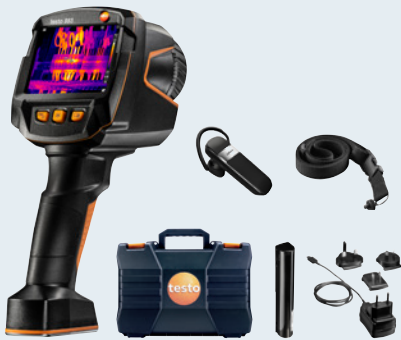
Order no. 0560 8831