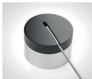
Freeze-drying probe holder