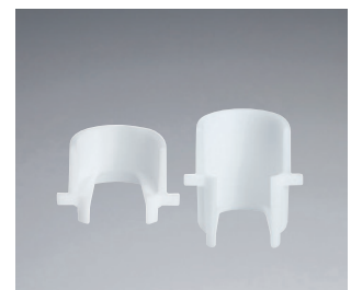
Distance adapter short or long