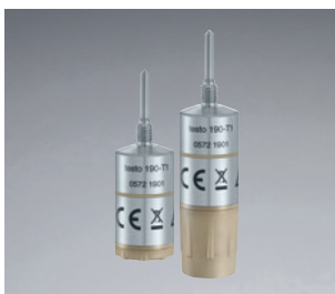
Small or large battery