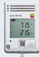
testo 160 IAQ