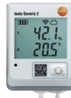
testo Saveris 2-H2