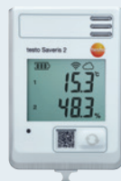
testo Saveris 2-H1