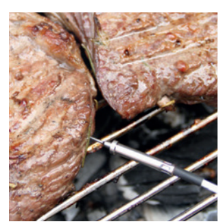
Fast monitoring of the core temperature on a grill