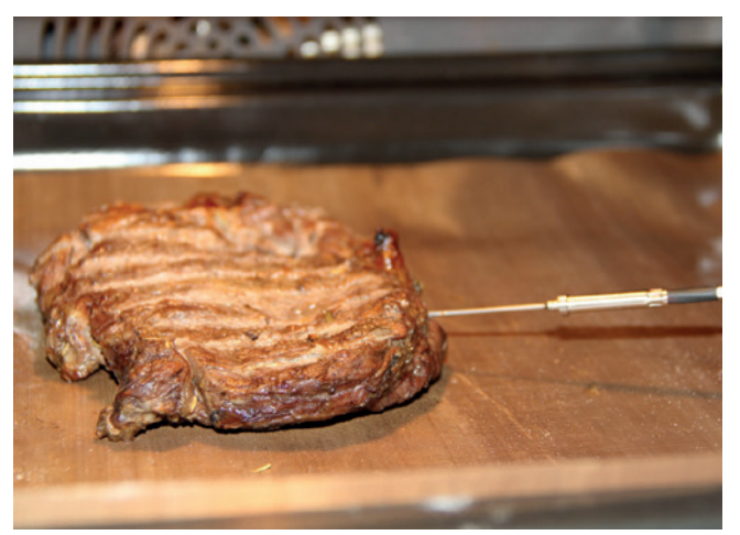
Precise monitoring of the cooking process in an oven