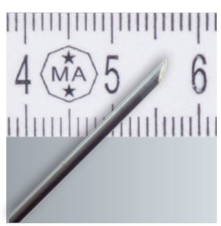
Sharp measurement tip with a small diameter

We are happy to adapt probes to suit your individual requirements. Simply send us a short mail to: vertrieb@testo.de .