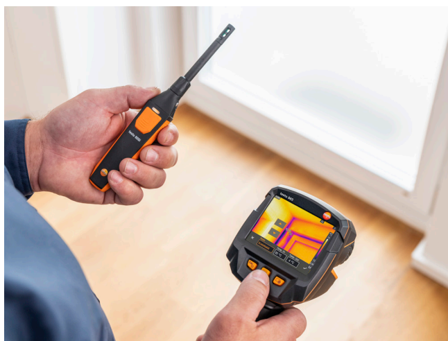
Thermal imager testo 883 with thermo-hygrometer testo 605i for mould indication.

More information and answers to all your questions concerning thermography and humidity measurement at www.testo.com .