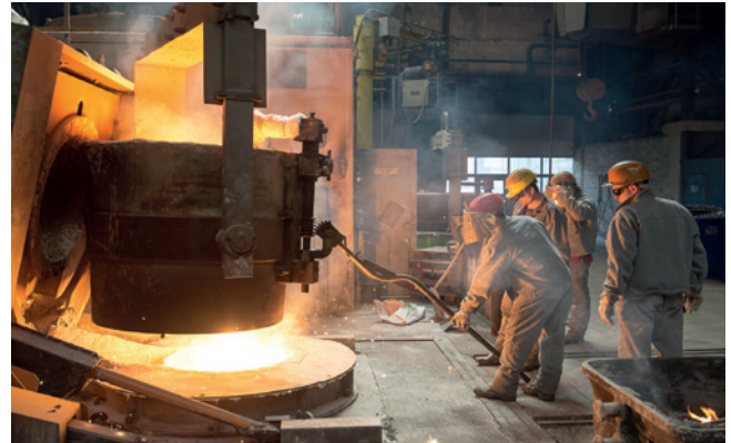
Tapping a blast furnace.

Relevant pollutants which occur in coke production are, in addition to dust, above all SO 2 , NO x , CO and organic components. With regard to permitted limit values, the exhaust gases are subject to certain limit values, and their composition allows conclusions to be drawn on the monitoring and optimization of the production process.