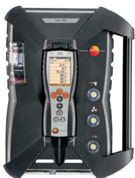
The emission measuring instrument testo 350.

More information on the testo 350, and answers to all your questions concerning emission measurement at www.testo.com .