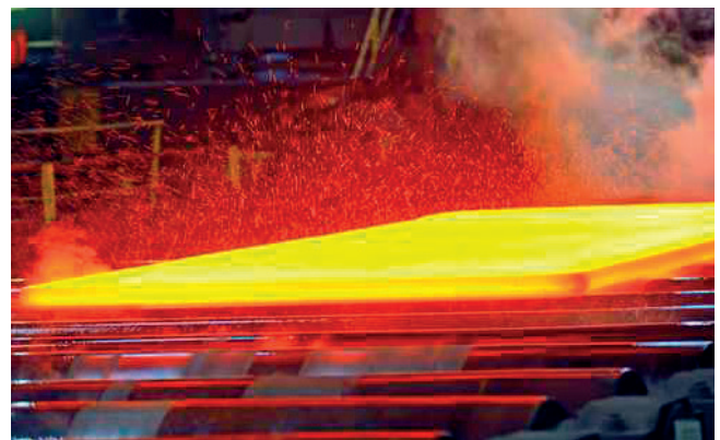
Freshly produced steel.