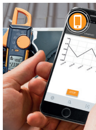
Convenient display and documentation of the measurement results using the testo Smart App.