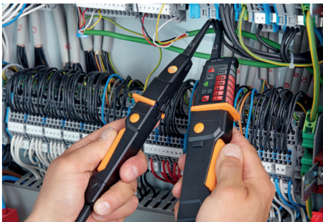
Measuring voltage in a switching cabinet.

Complies with latest voltage tester standard