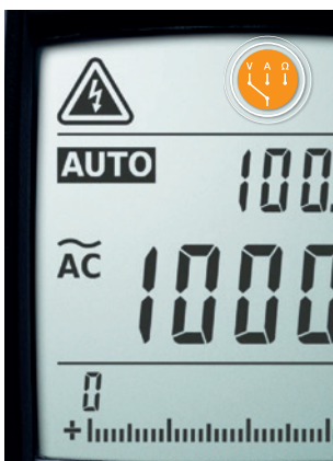
Automatic measurement parameter detection