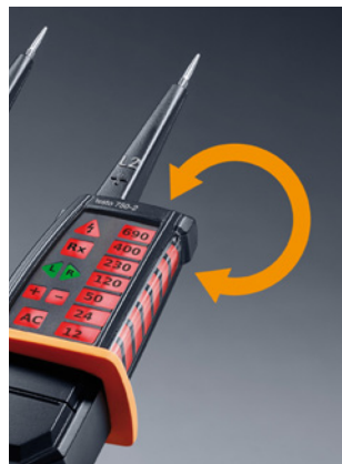
The testo 750 voltage tester features an all-round LED display.