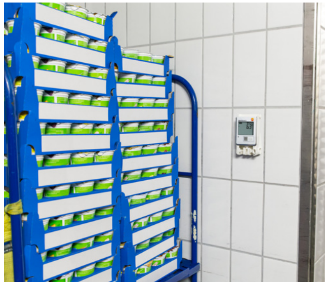
With testo Saveris 2, you monitor all refrigerated rooms at a glance.