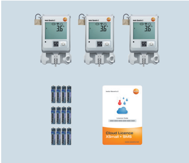
The starter set for supermarkets: 3x WiFi data logger, 3x 4 Energizer batteries, 1x XS Cloud licence