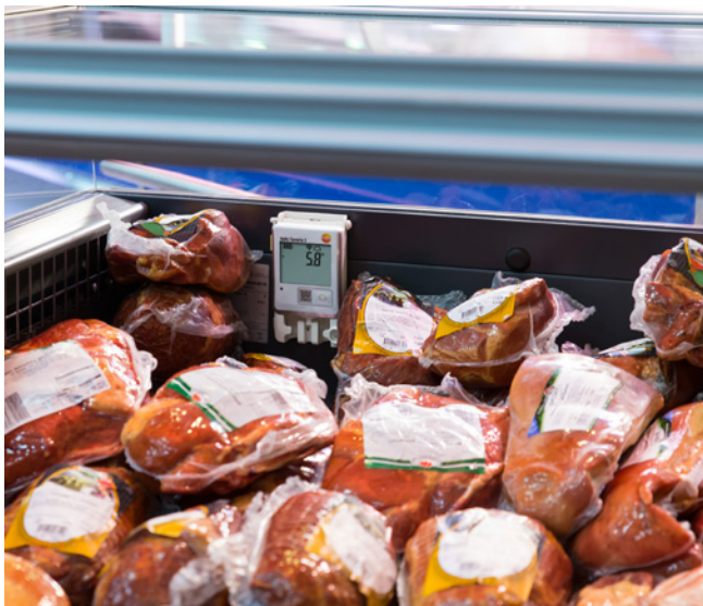
WiFi data loggers save you the manual documentation of individual refrigerated display.