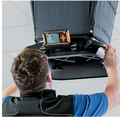
Tiltable and removable display