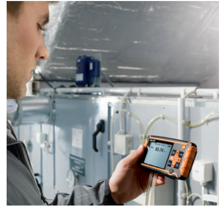
Differential pressure measurement with connection hose