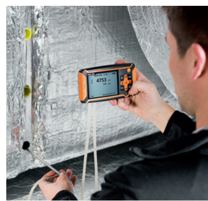
Pitot tube measurement in a duct