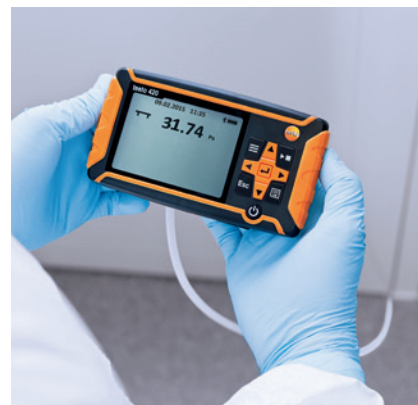
Differential pressure measurement with connection hose