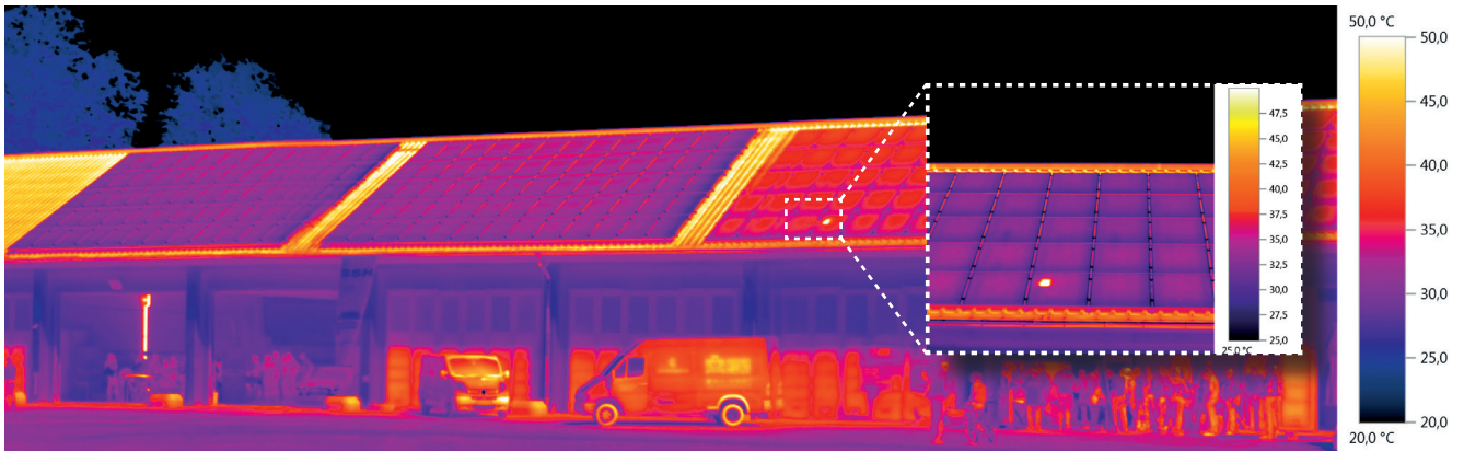
Panorama image of the photovoltaic system and detailed analysis with the telephoto lens.