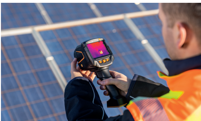
Thermal imager testo 883

More information and answers to all your questions concerning thermography at www.testo.com .