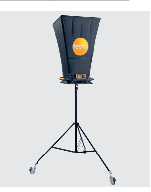
Sturdy, wheeled tripod (optional) for large jobs or sites with high installed outlets. Convenient hands free 420 hood operation with Bluetooth connectivity.