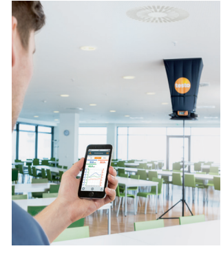
Testo 420 Bluetooth App allows for Smart, hands-free operation. Display and create custom reports on mobile devices. Send reports via email from the job site.