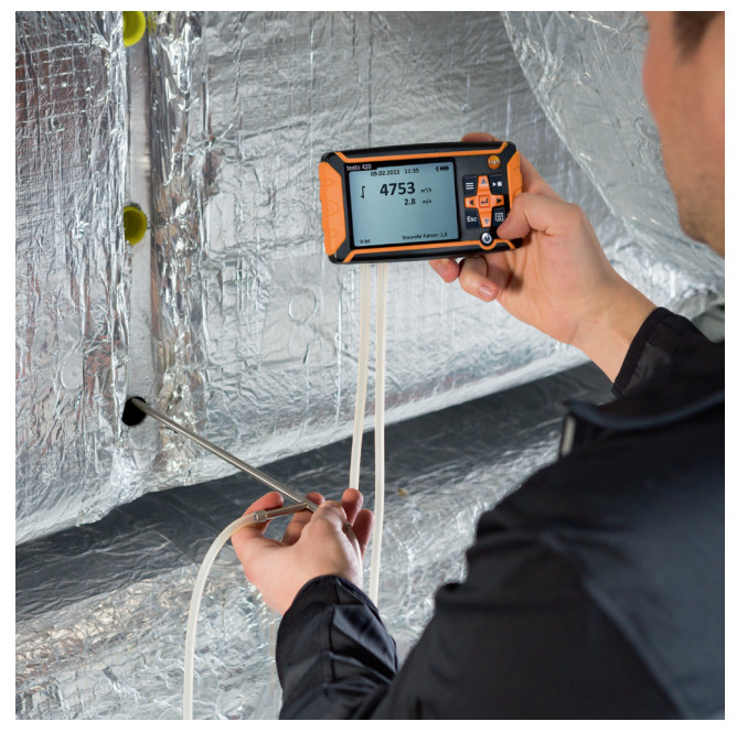
Detachable Differential Pressure (t420) instrument allows Pitot tube measurements in ducts (Pitot tube optional)

Testo Inc. 40 White Lake Road Sparta, NJ 07871 P: 1-800-227-0729 F: 1-862-354-5020 info@testo.com