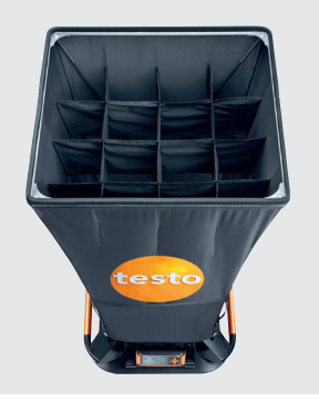
Patented flow straighteners are standard in all 420 flow hood sizes and configurations.