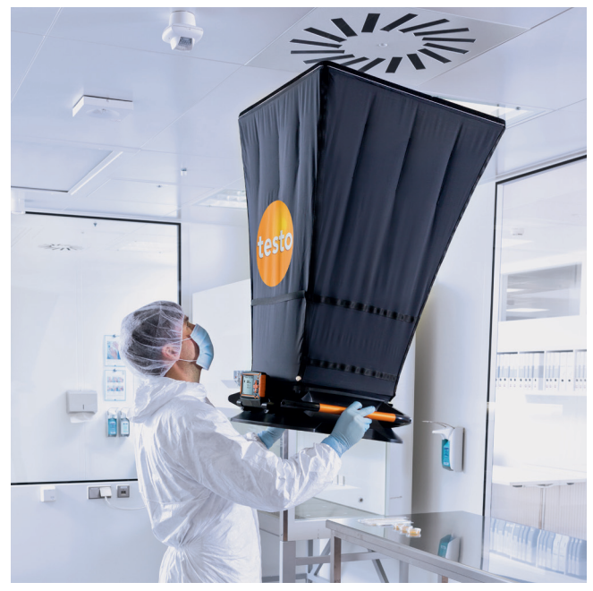
Precision measurements for critical applications