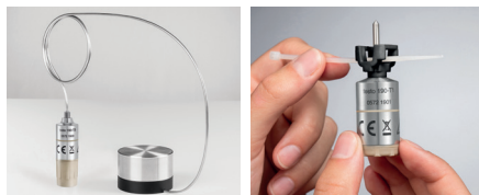
Freeze-drying Probe holder Retaining clamp