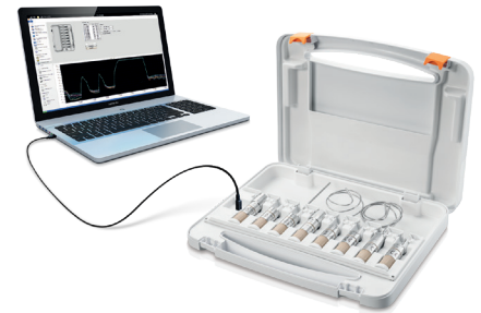
testo 190 CFR software