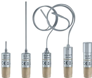
testo 190 CFR data logger

The validation of your sterilization and freeze-drying processes is a key element of product quality assurance and shows the high level safety of your products you manufacture. The new 21 CFR Part 11 certified software coupled with robust data loggers provides the support you need to achieve your GxP compliance reliably without sacrificing efficiency.