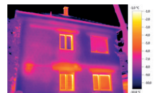
Thermal image with ScaleAssist